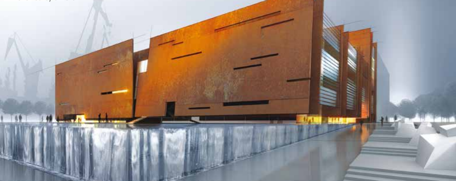
Visualization - PPW FORT Ltd., made available by the municipality of the city of Gdańsk.

The designers' architectural intention was for the Fallen Shipyard Workers Monument and Gate No. 2 of the former Gdańsk Lenin Shipyards located near the Health and Safety Hall (where on 31 August 1980 the Interfactory Strike Committee signed an agreement with the Government of the People's Republic) to become physically part of the permanent exhibition of the ECS, which is the heart of the complex.